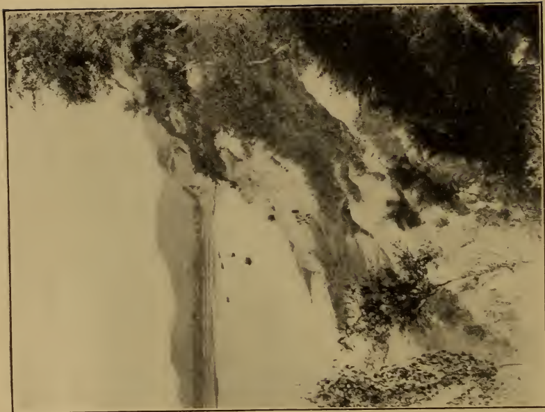
SCENERY ALONG THE RIVER LIN.